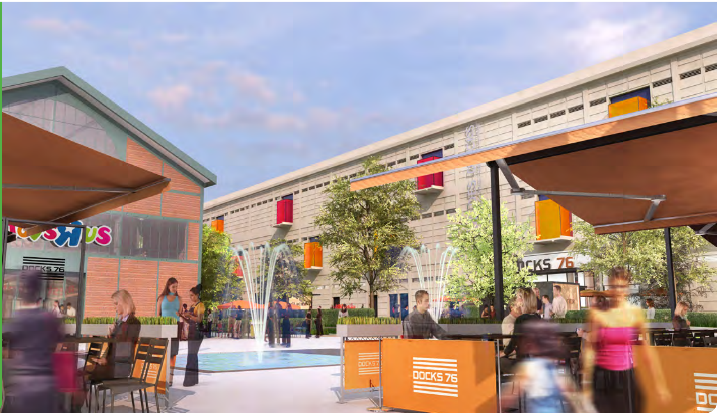
Docks 76 retail development in Rouen, France.